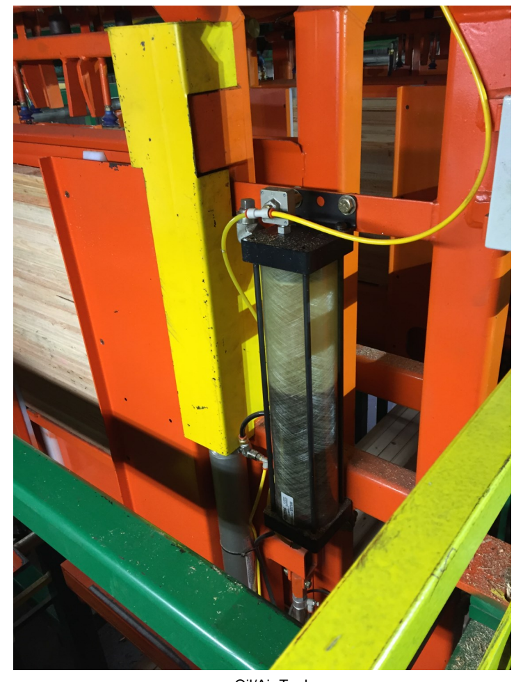
Oil/Air Tank 4" bore x 20" Stroke Clear composite barrel with aluminum heads